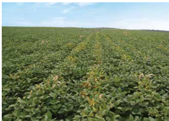
Symptoms of SDS (yellowing and browning) aren't visible until midsummer.