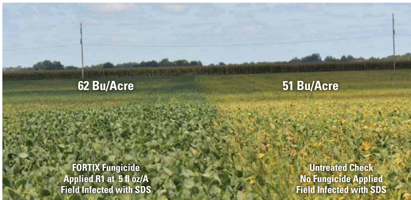
Soybean field infected with SDS, August 8, 2014, Hancock County, IL

For more information about FORTIX, talk to your Arysta LifeScience representative or visit FORTIXFungicide.com .