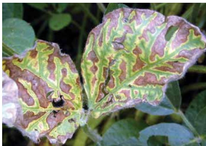
Characteristic interveinal yellowing and browning on the upper trifoliates.